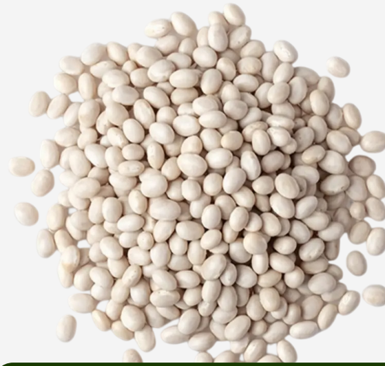
WHITE KIDNEY BEANS

Our dry pulses are sorted, graded, and packed to meet the highest international standards. From white kidney beans to chickpeas, these pantry staples offer consistent quality and reliable supply for canners, manufacturers, and distributors.