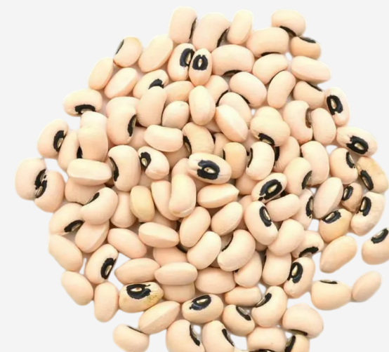
BLACK EYED BEANS

Rich flavor, dense texture, and consistent quality. A cornerstone of Egyptian cuisine and increasingly popular globally.