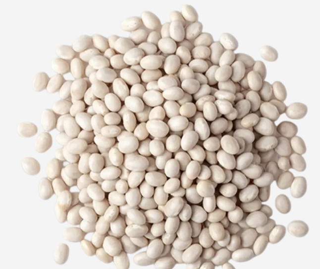
DRY WHITE BEANS

Protein-rich with creamy texture and nutty taste. The foundation of hummus, falafel, and countless global dishes.